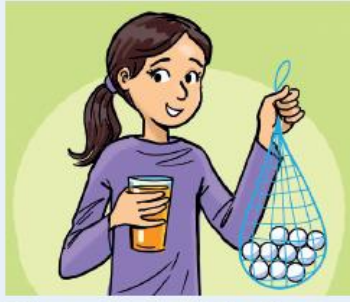
Elham has 10 balls.