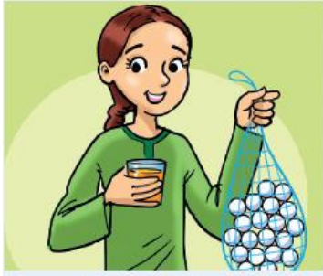
Joud has 20 balls.

Comparing two or more things with more , most , less and few .