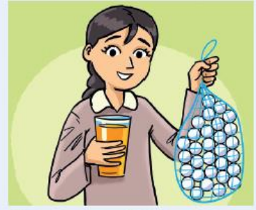
Salma has 30 balls.